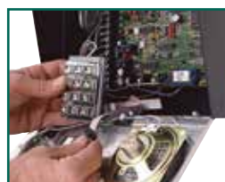
modular design makes installation and service easy