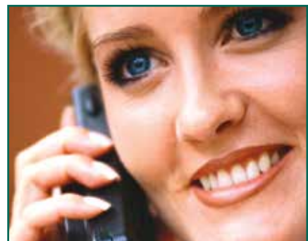
talk to front door or gate from any telephone in the home