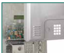
stainless steel plate and anti-vandal features